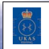
UKAS Accredited Testing